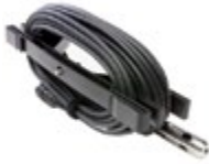
Cable Management Kit